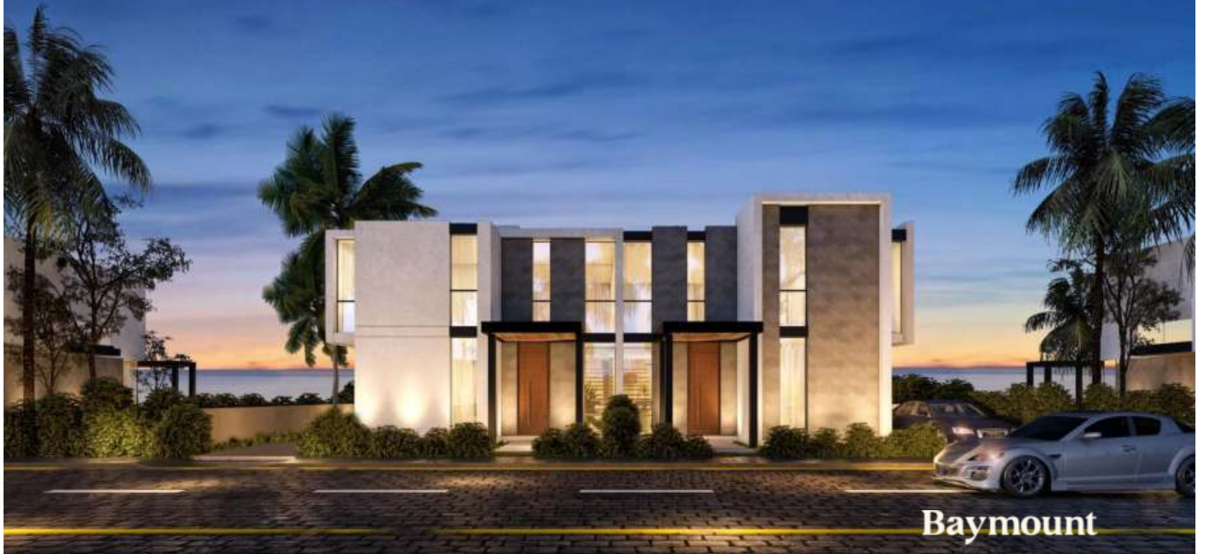
Double Floor Twin house