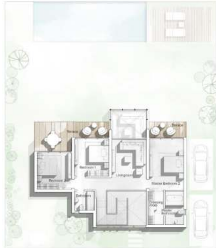
STAND ALONE VILLA – TYPE A Total Area 250m 2