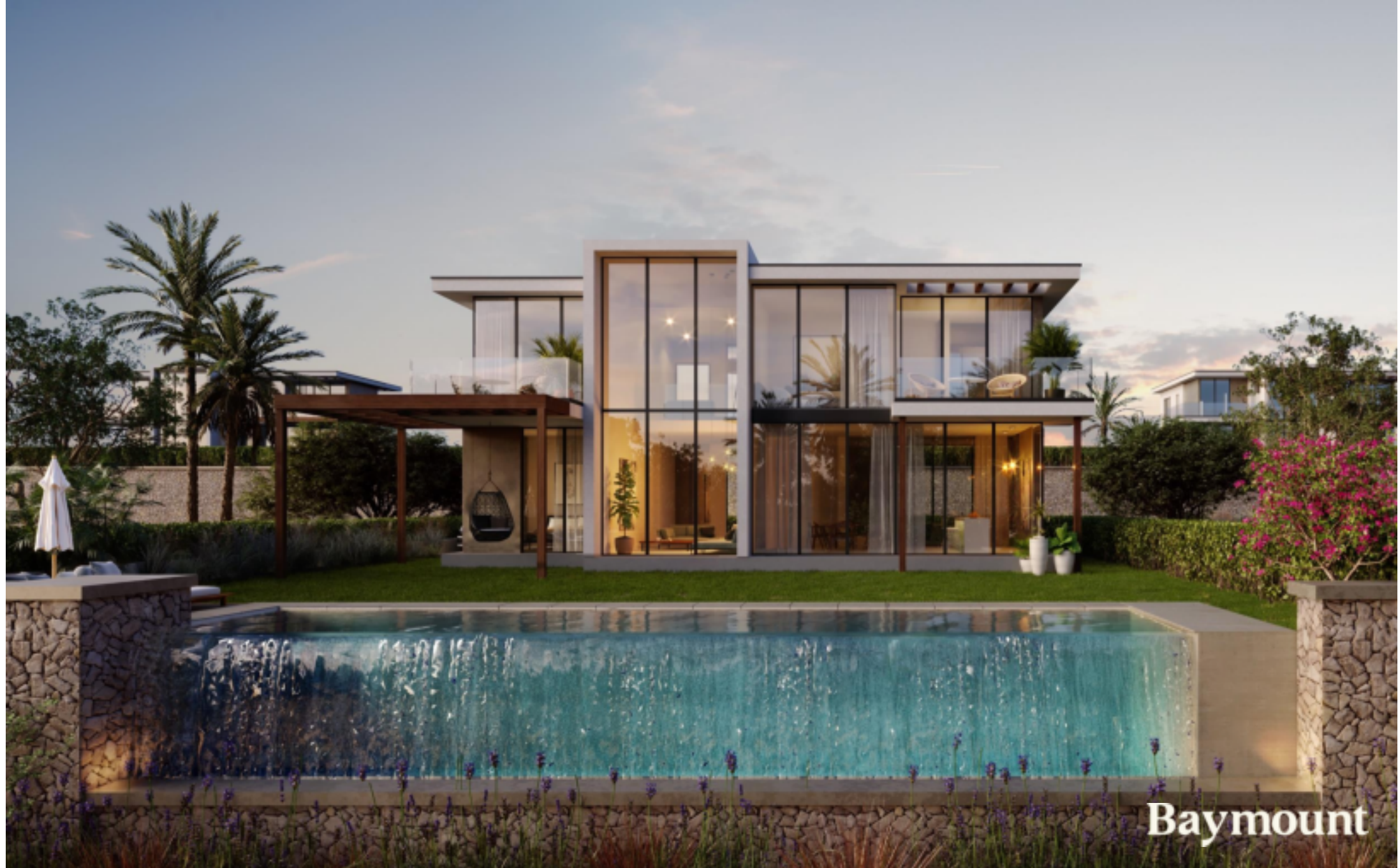
Stand Alone Villa – Type B