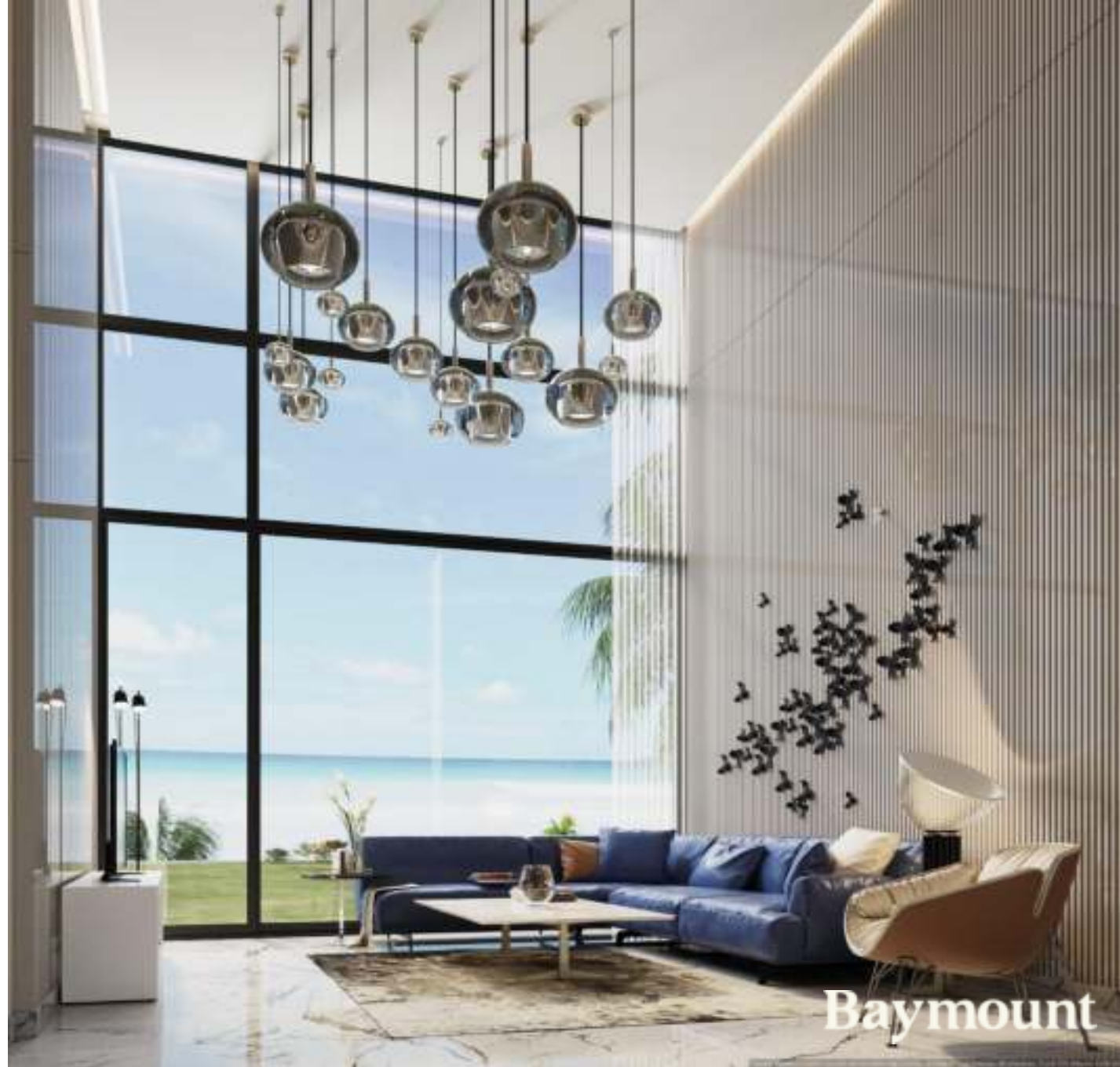
Stand Alone Villa – Type A