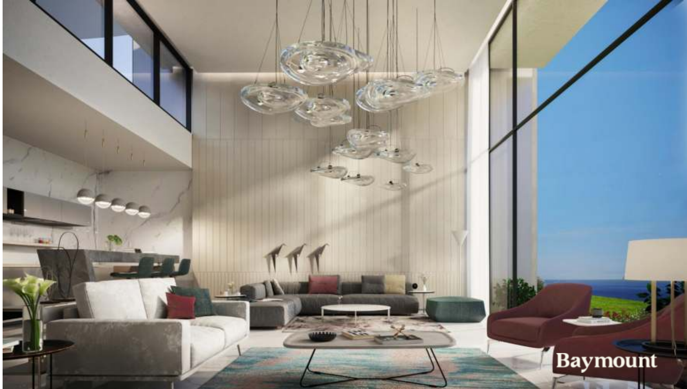
Single Floor Twin house