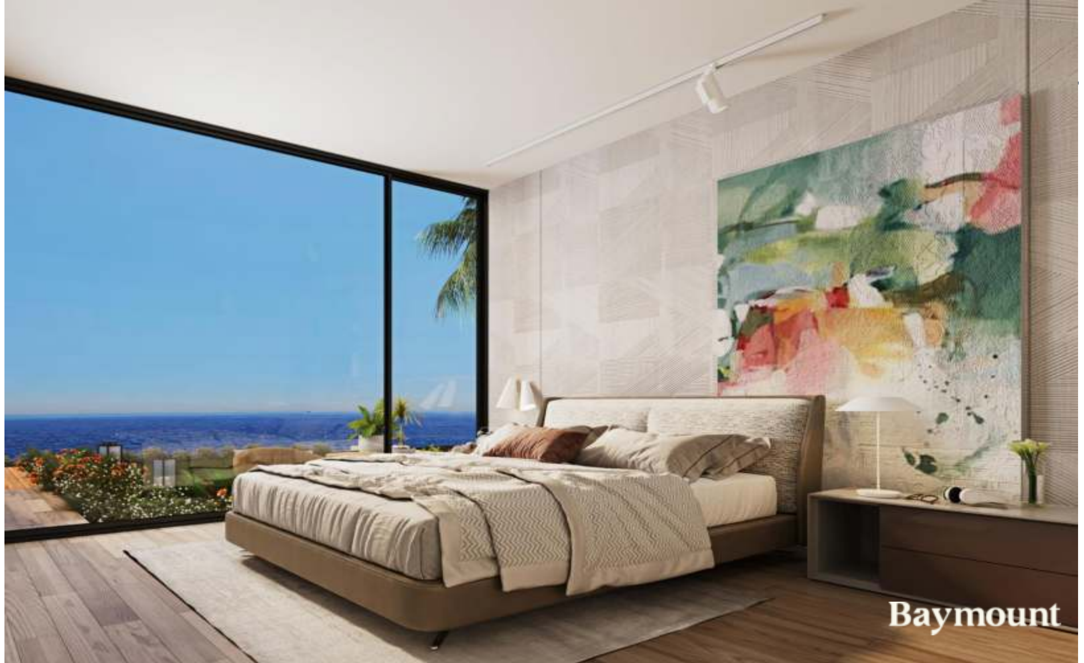
Stand Alone Villa – Type A