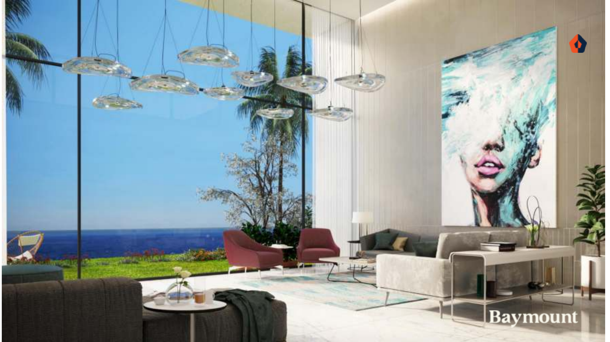
Single Floor Twin house