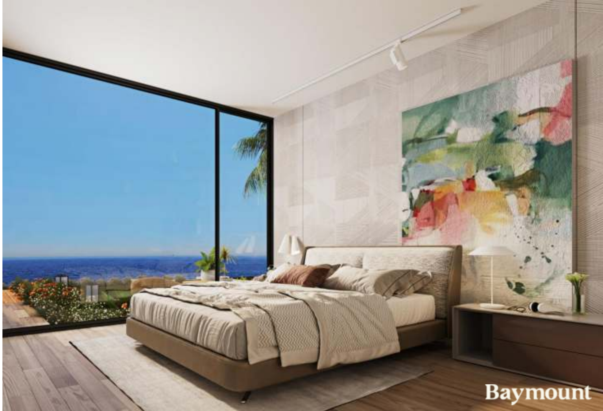
Stand Alone Villa – Type B