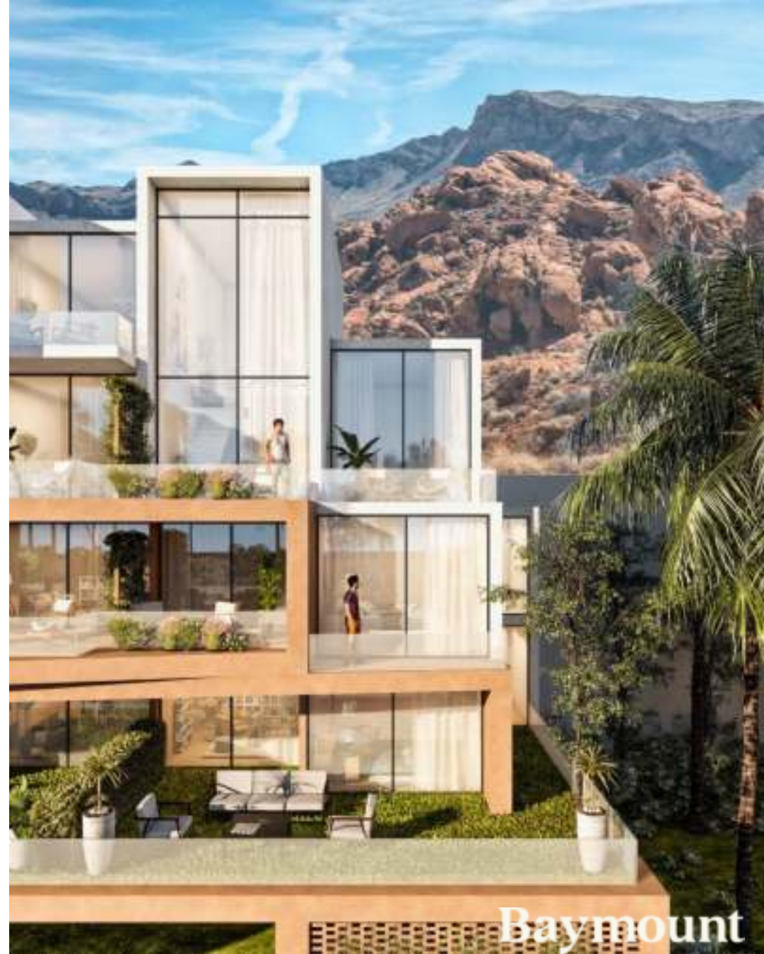
Chalets & Lofts building