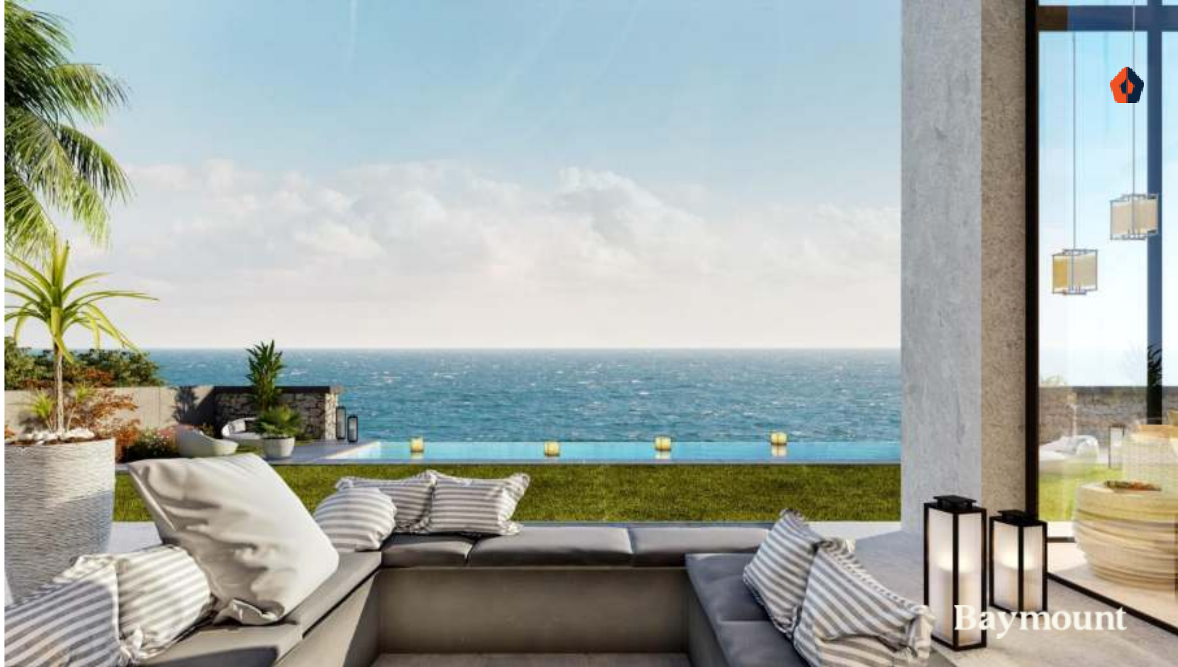
Stand Alone Villa – Type A