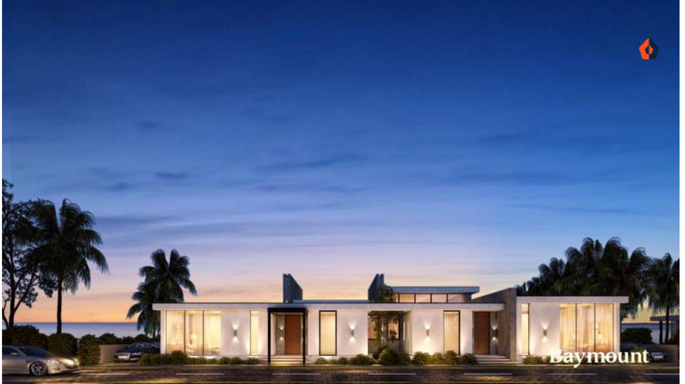
Single Floor Twin house