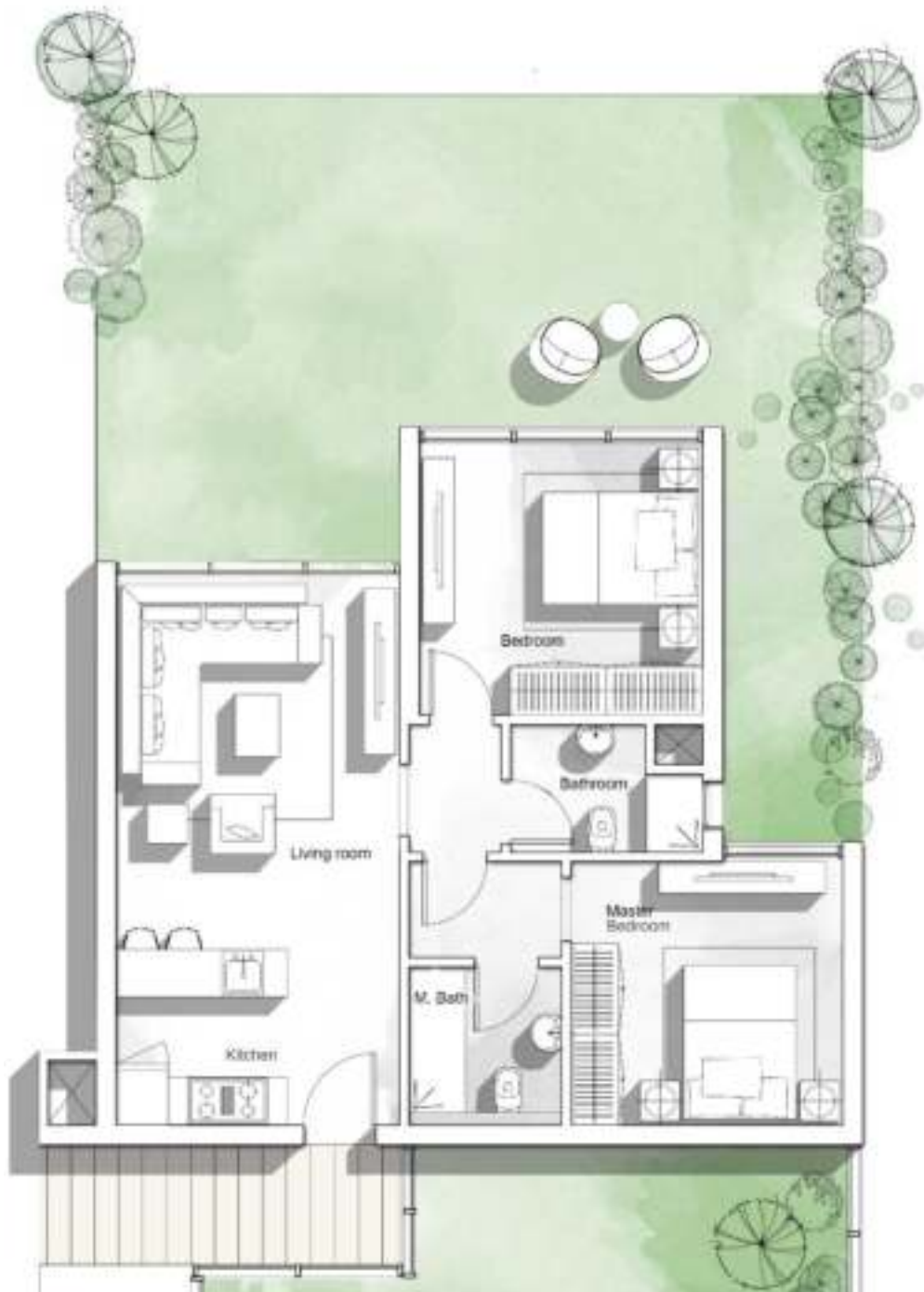
2 BEDROOMS CHALET Average Total Area 105m 2