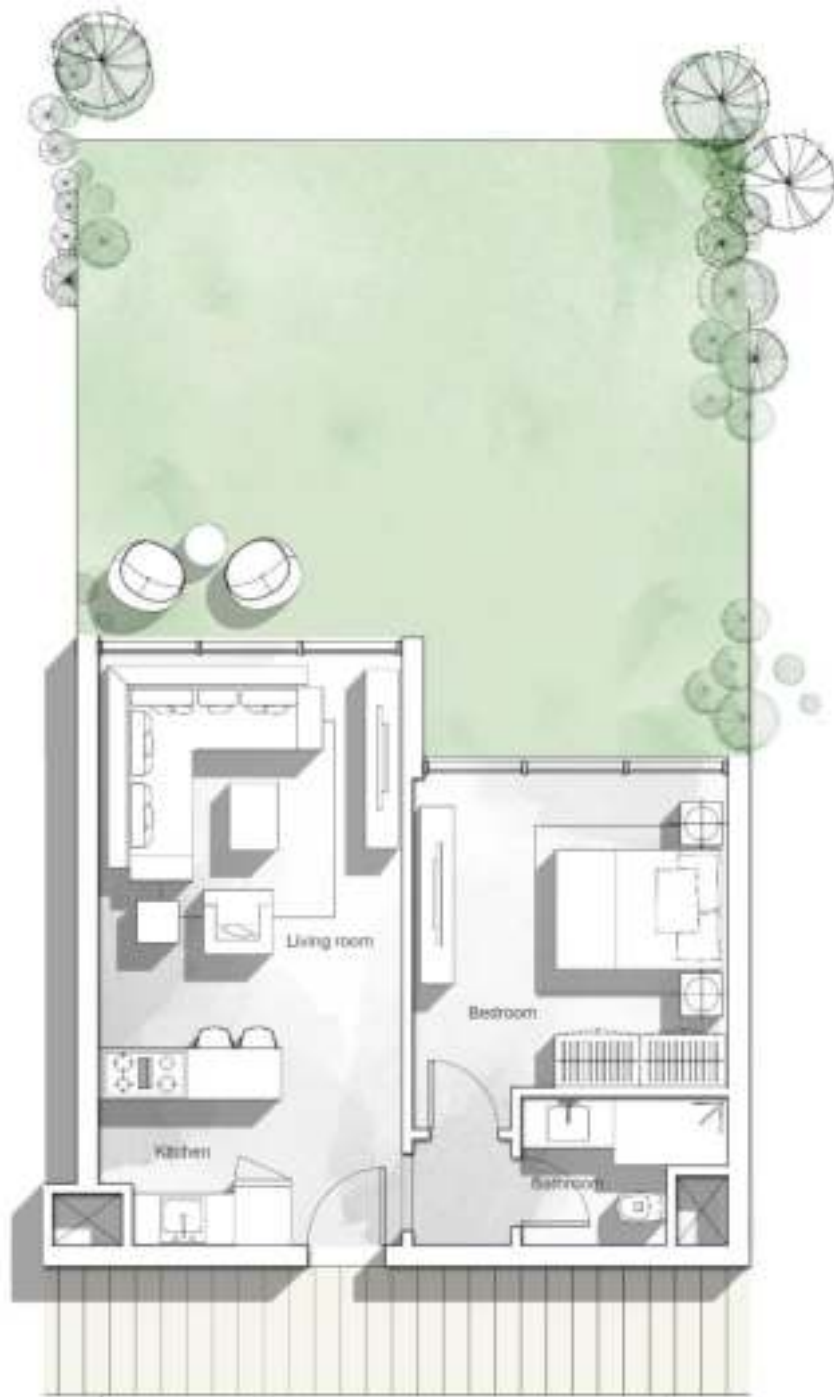
1 BEDROOM CHALET Average Total Area 83m 2