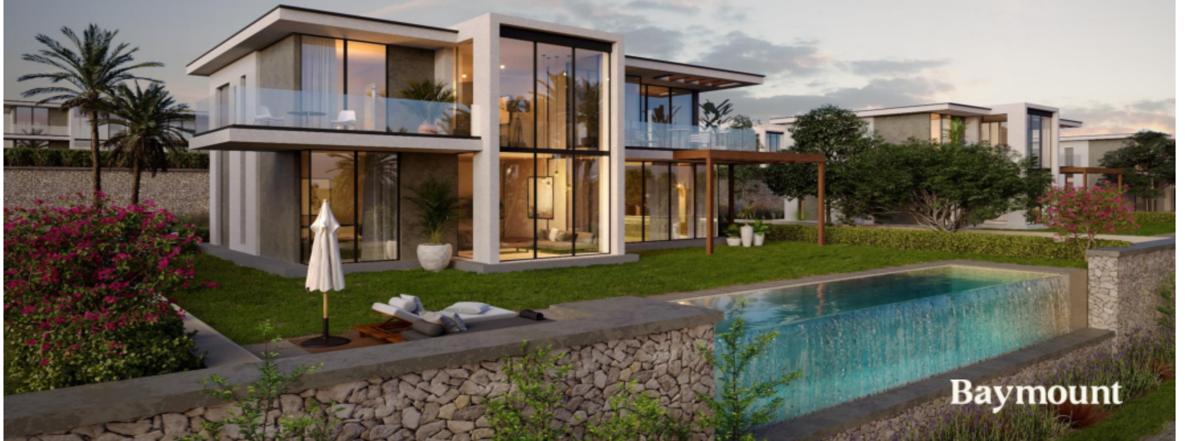
Stand Alone Villa – Type A