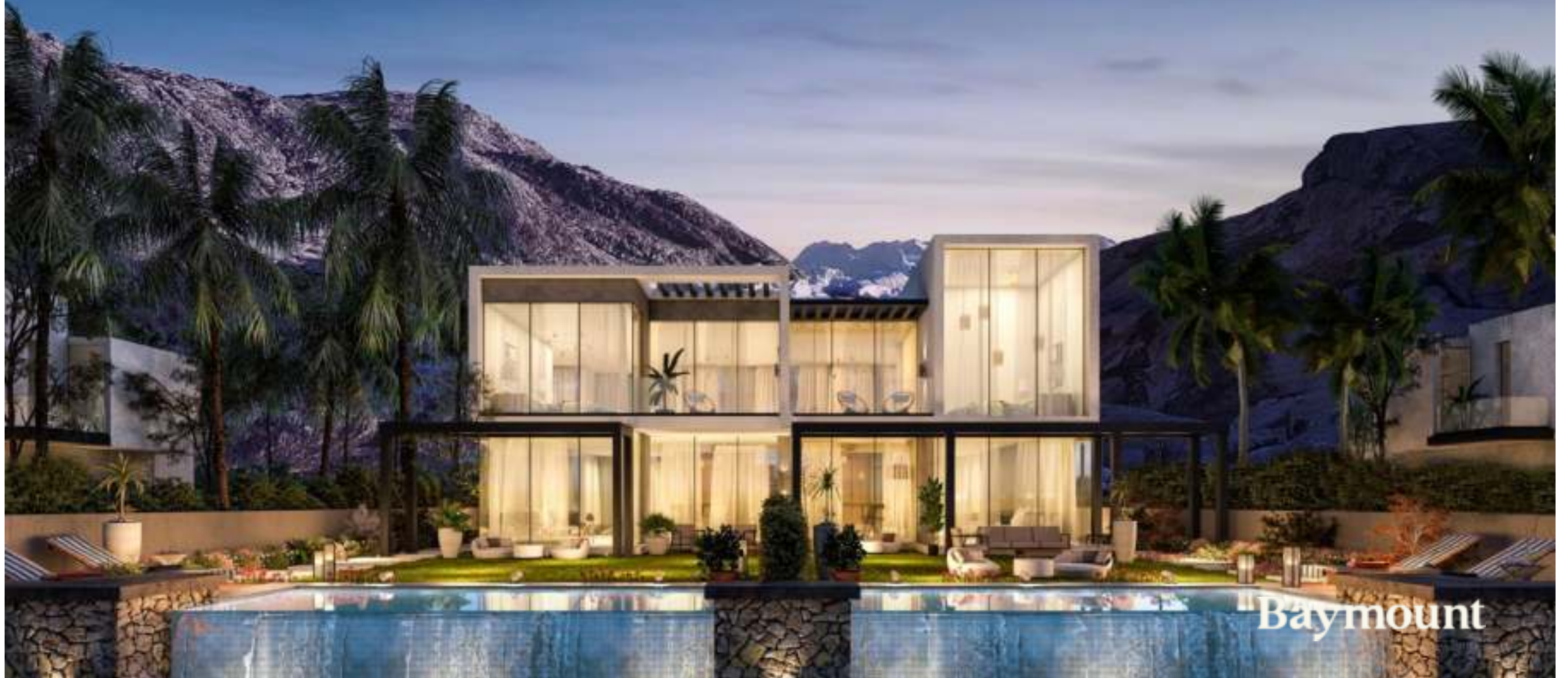
Double Floor Twin house